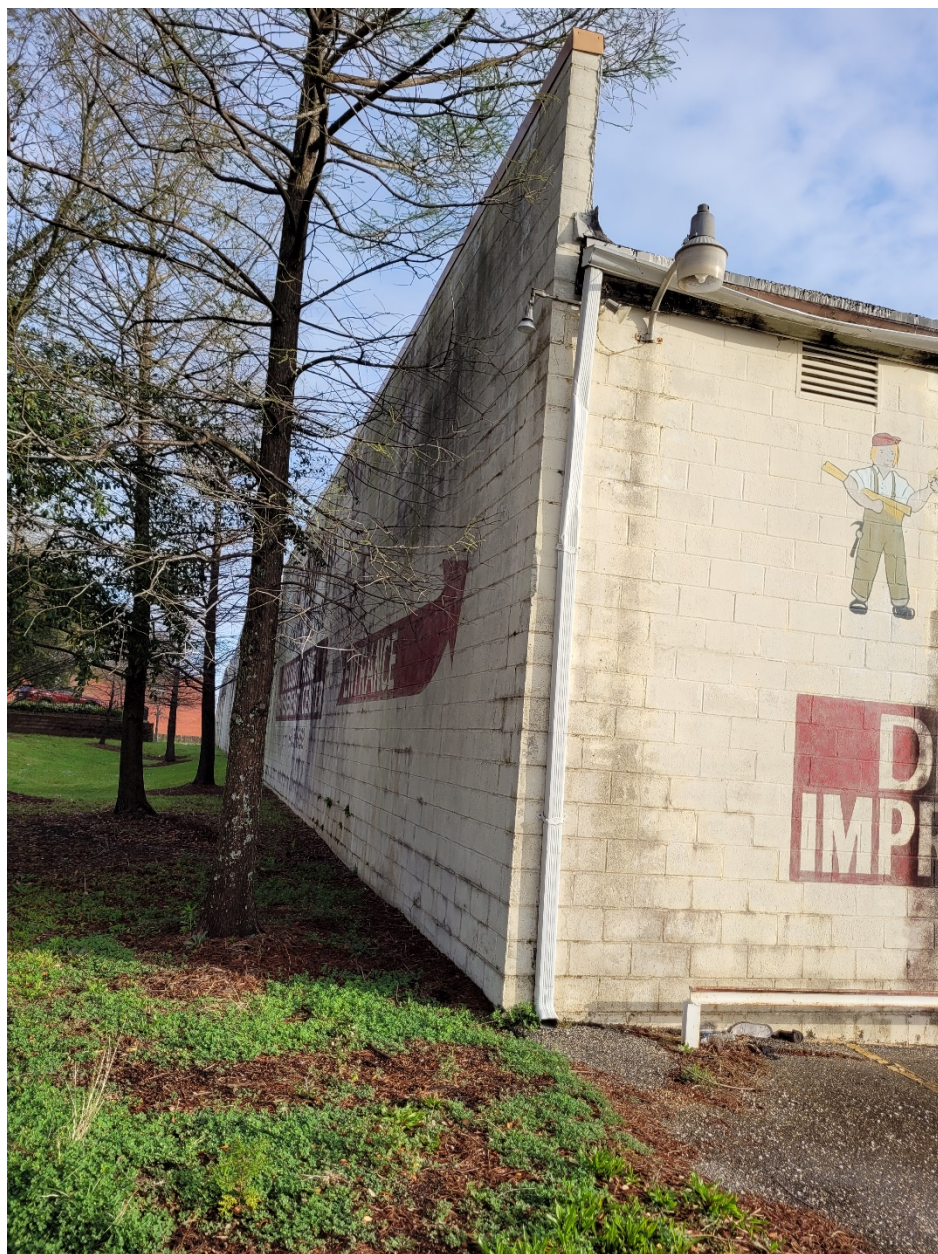
West face - view from southwest corner

Alabama State Port Authority Former Handymans Railroad Salvage 70 Adams Street, Mobile, AL