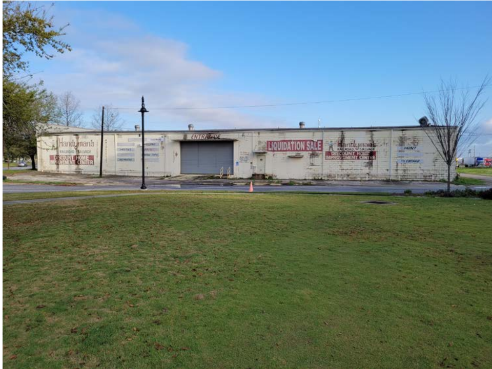
South Face – approximately 162' x 16'

Former Handyman's Railroad Salvage 70 Adams Street, Mobile, AL