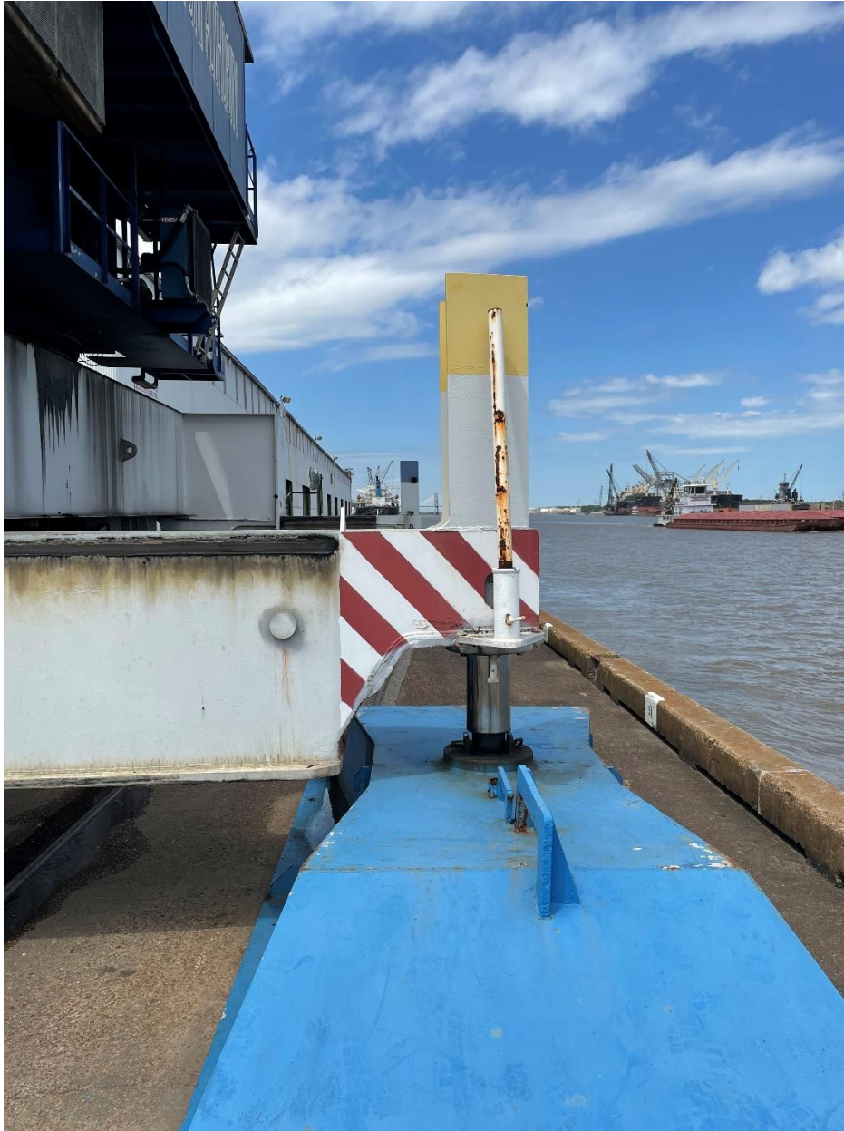
Figure 3. A sample of painted chevrons and markings on Gottwald crane.