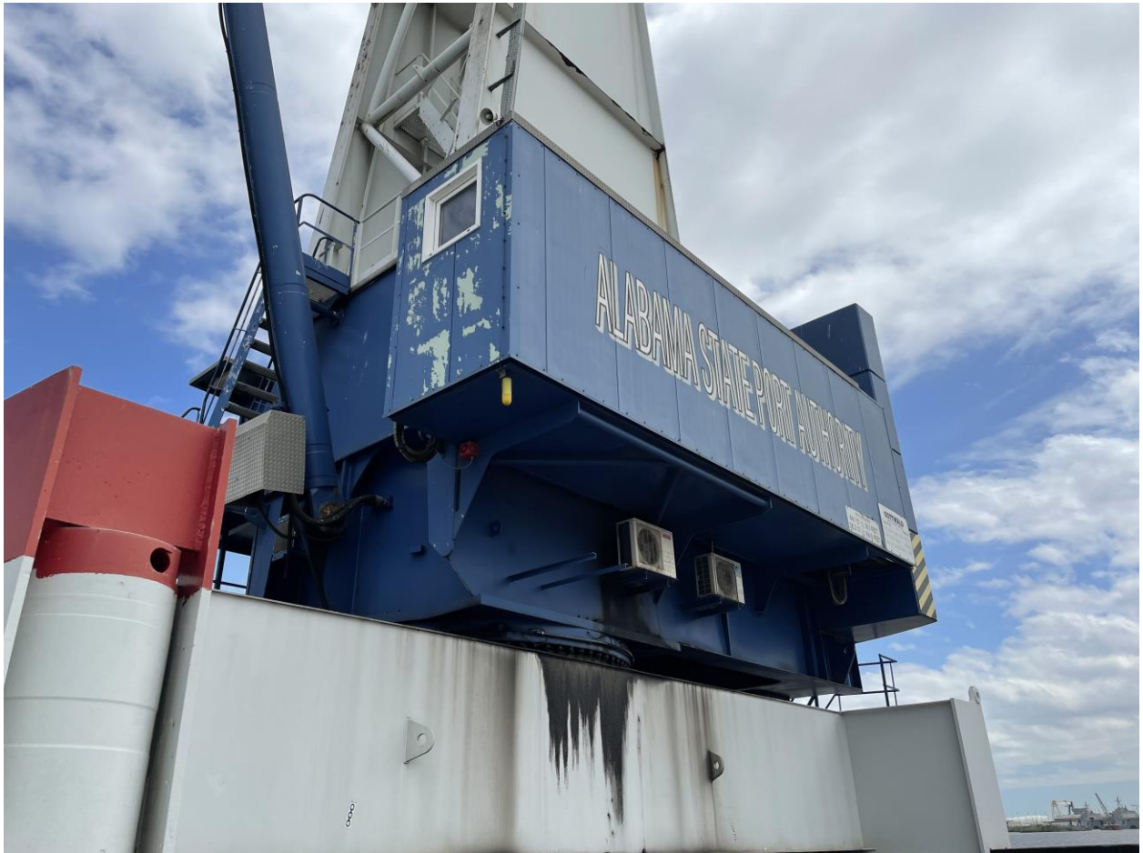
Figure 7. Corner view of Gottwald crane showing common paint deterioration and lettering.