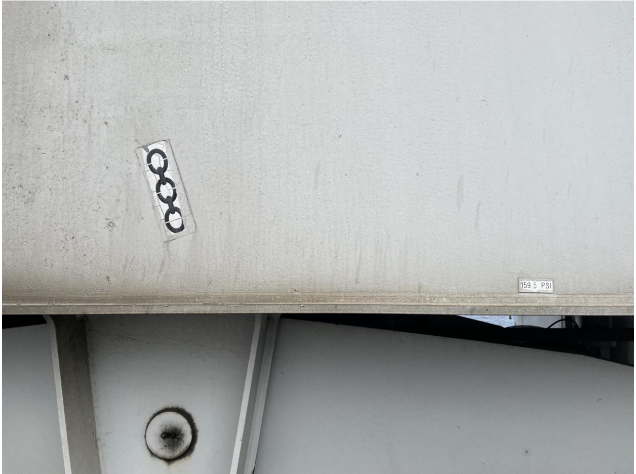
Figure 6. A sample of more decals found on Gottwald crane. Left is adhered decal. Right is raised decal.