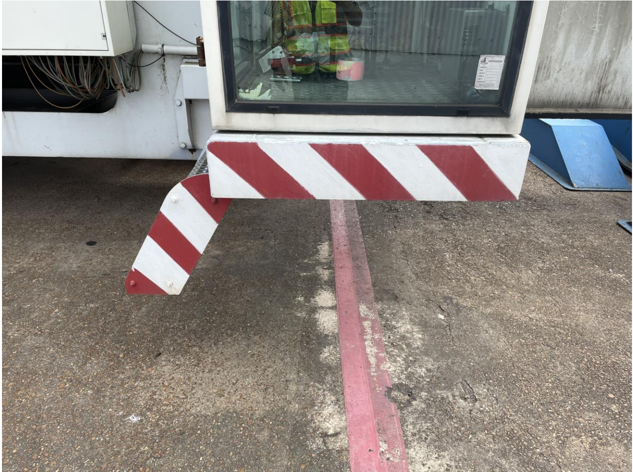
Figure 5. A sample of painted chevrons on Gottwald crane.