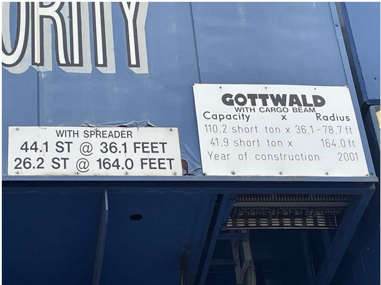
Figure 8. A sample of mechanically fastened decals found on Gottwald crane.