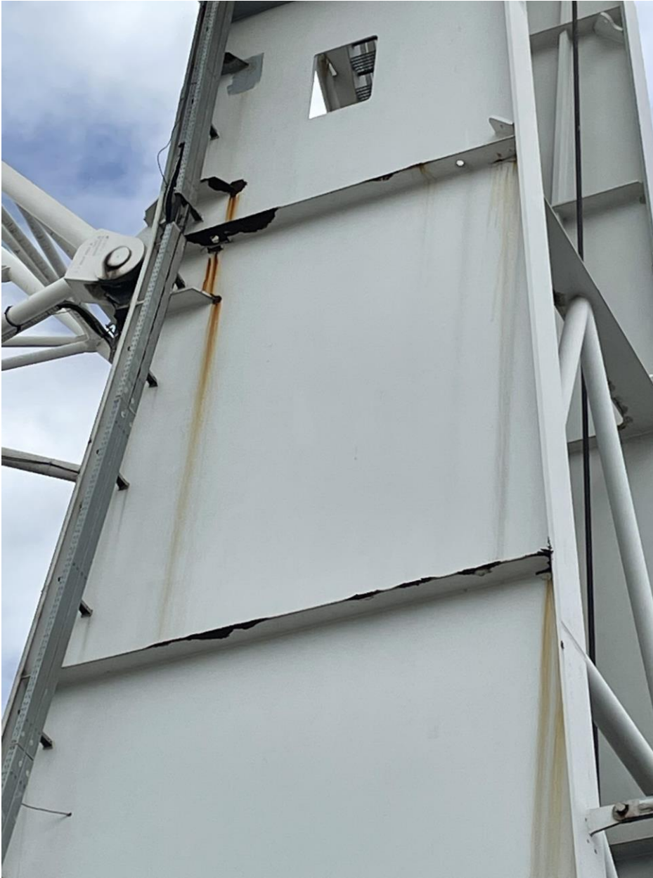
Figure 11. A sample of rust and deterioration on Gottwald crane.