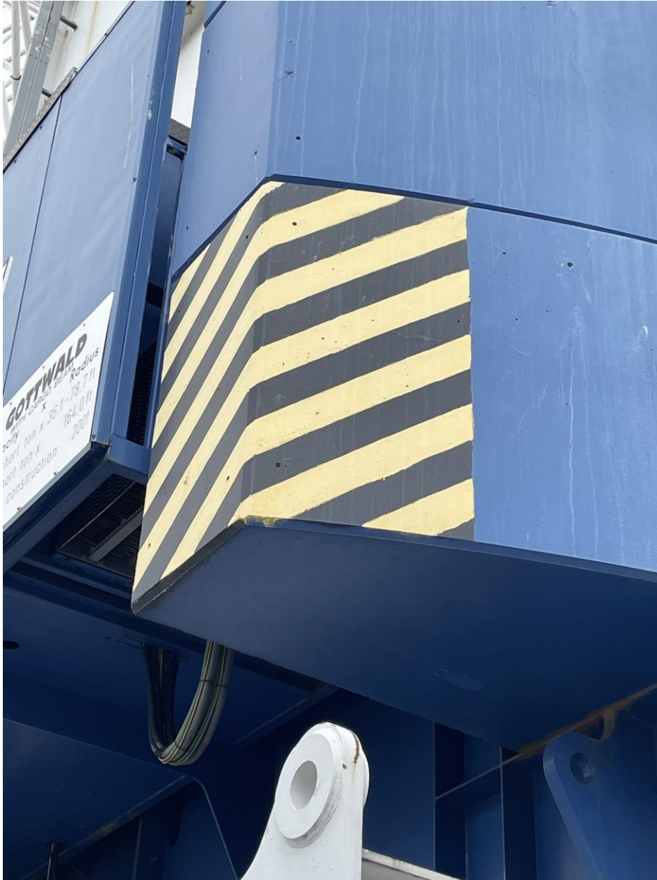
Figure 12. A sample of painted chevrons on Gottwald crane.