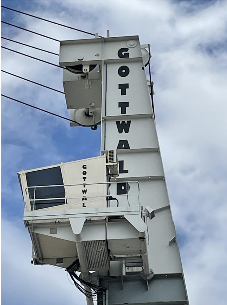
Figure 9. A sample of lettering on Gottwald crane.