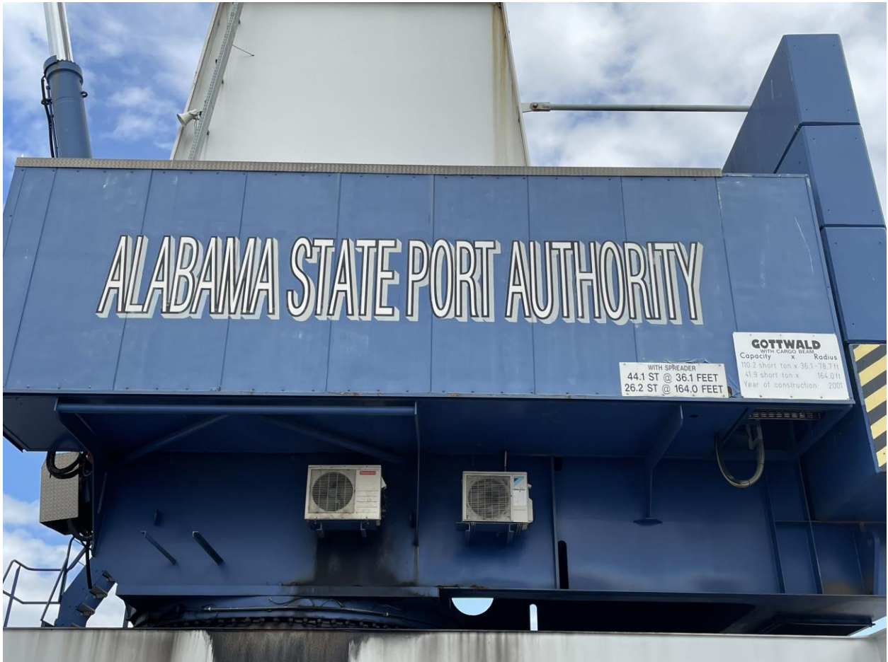
Figure 10. A sample of lettering found on Gottwald crane.