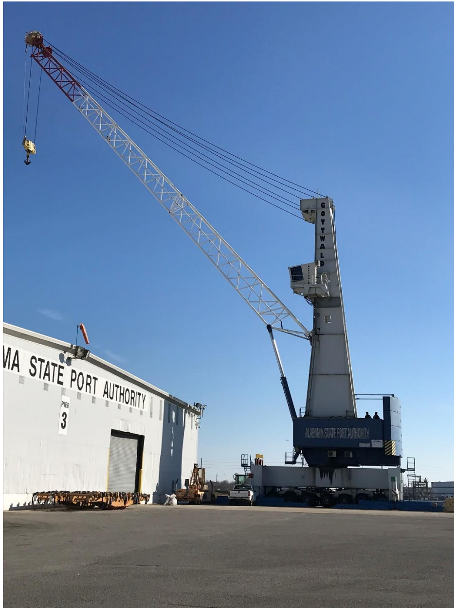
Figure 1. Side view of Gottwald crane.