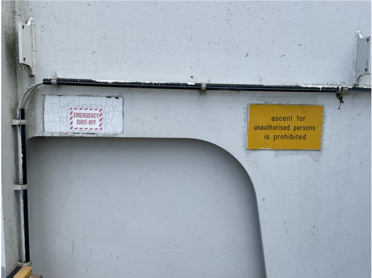
Figure 4. A sample of decals on Gottwald crane. Left is adhered decal. Right is raised decal.