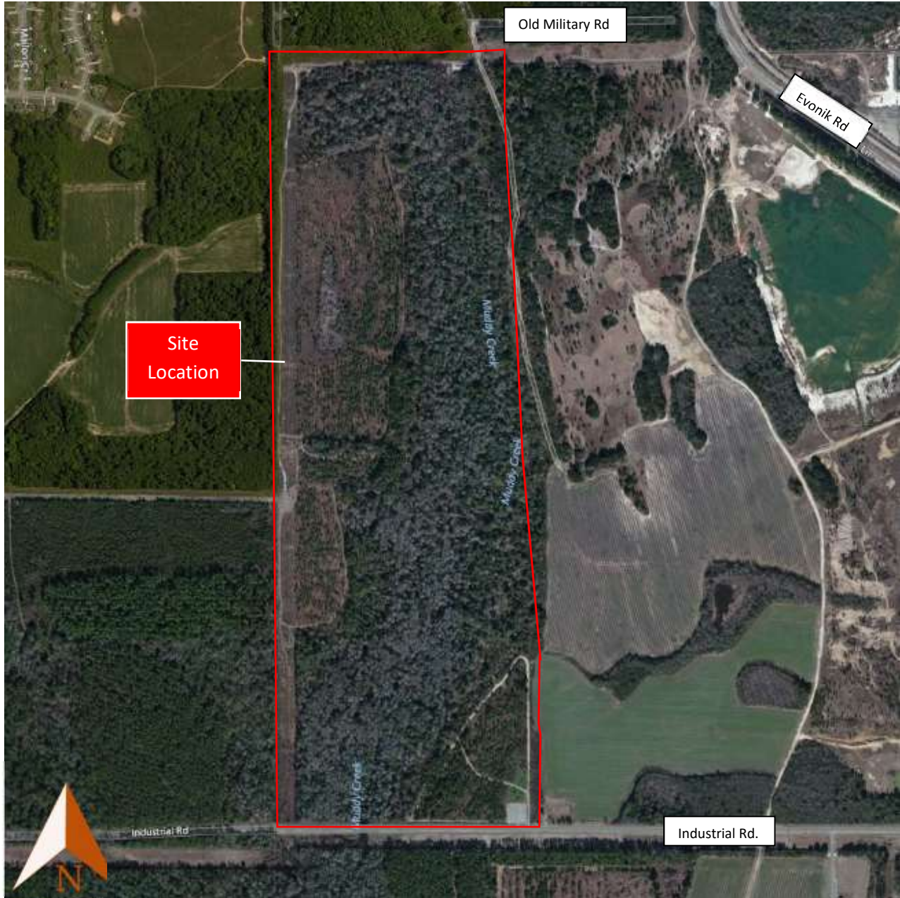
Figure 1 – Muddy Creek Mitigation Site Location Industrial Rd, Theodore, AL 36582, USA Latitude: 30.517057 | Longitude: -88.152781